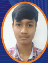
Birlang, Electrical Engineering Assam Engineering College, Gauhati