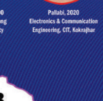
Pallabi, 2020 Electronics & Communication Engineering, CIT, Kokrajhar

Total- 33 Students have cleared JEE MAIN 2024